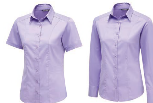
SS & LS Lilac