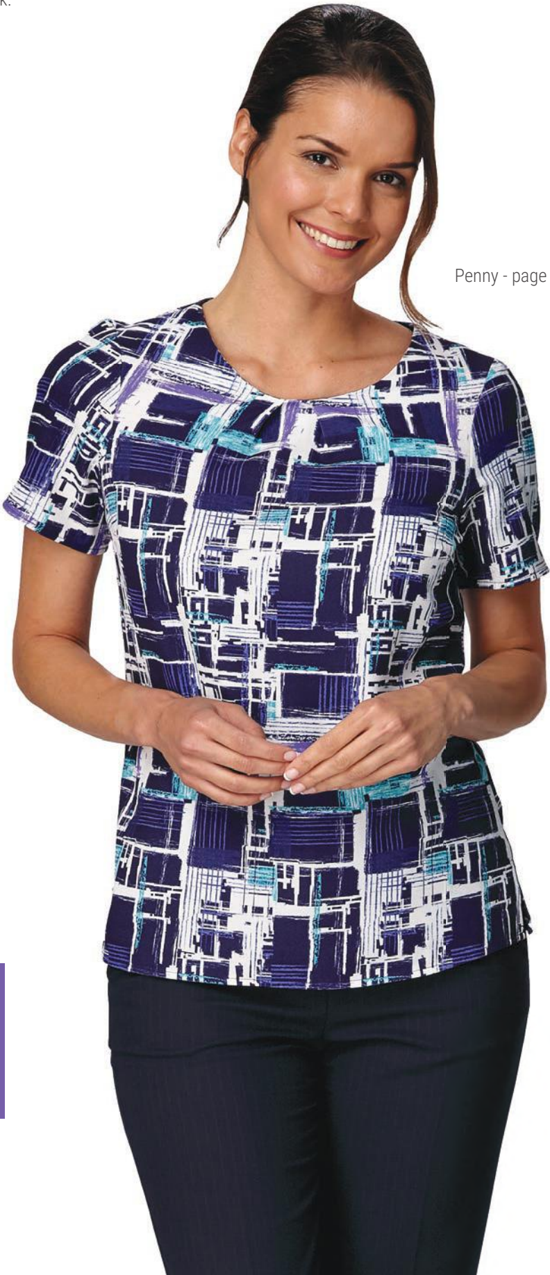
Penny - page 13

vortexdesigns AVAILABLE FROM STOCK SAME DAY DESPATCH vortexdesigns