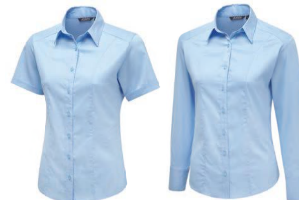
SS & LS Sky