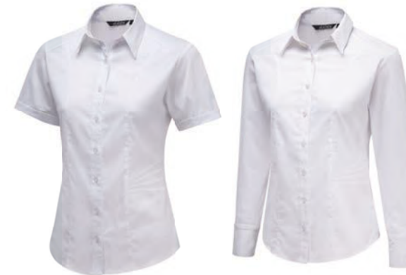
SS & LS White

Sleeve: Long & Short Sleeve available. Composition: 97% Polyester, 3% Elastane Sizes: 6-26