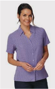
Shown with Emma blouse See Page 16