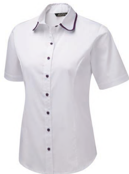
White with Berry Trim